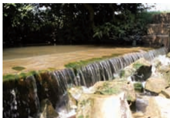
Watershed management through conservation structures